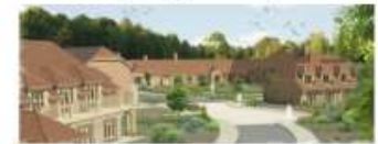
86 unit Care-home Development (Titchfield)