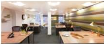
Serviced Office (London)