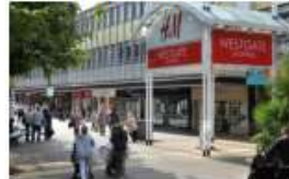
Distressed Retail (Stevenage)