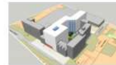
153 unit Student Development (Reading)