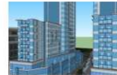
350 unit Affordable Residential (Stevenage)