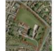
152 unit Care-home Development (Chippenham)