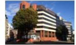
130 unit Student Re-Development (Bristol)