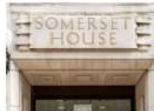
Serviced Office (Birmingham)