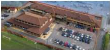
Serviced Office (Gloucester)