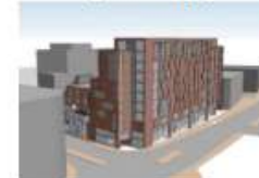
323 unit Student Development (Birmingham)